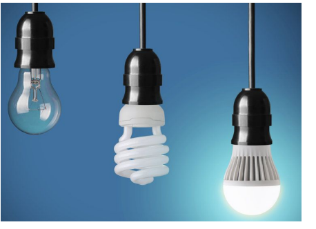
LED LIGHT BULBS

A thermostat that matches your schedule to save on heating