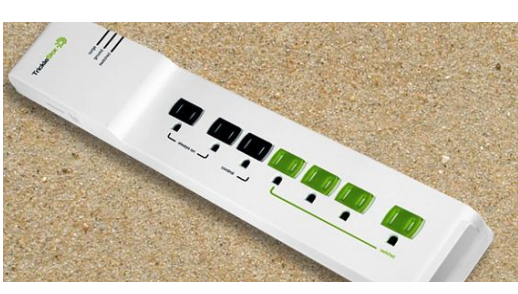
ADVANCED POWER STRIPS

Water savings + more consistent shower flow