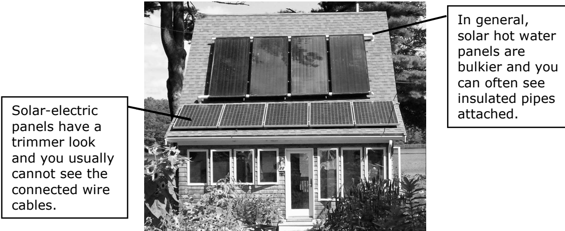
House with solar hot water panels (top) and solar-electric panels (on porch).